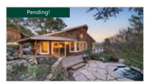
70 El Gavilan Road, Orinda

4 Bd | 2 Ba | 2007 Sqft | $2,250,000 Custom home by Dan Bartlett of DB Design Build features, soaring ceilings, wall of multi-sliders & scenic views