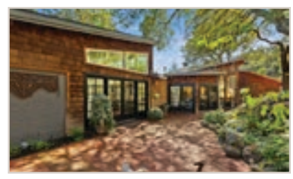
1749 Toyon Road, Lafayette

Private .87 acre lot provides a picturesque setting w/ views of the stately trees and surrounding hills!