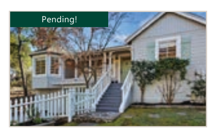
241 Camino Pablo, Orinda

Incredible views, large square footage & a separate ADU w/