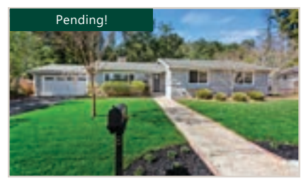
8 Harold Drive, Moraga

Light & bright! Private Lafayette charmer offers 4 bd/ 3 ba, 2278 sqft on .9 acre.